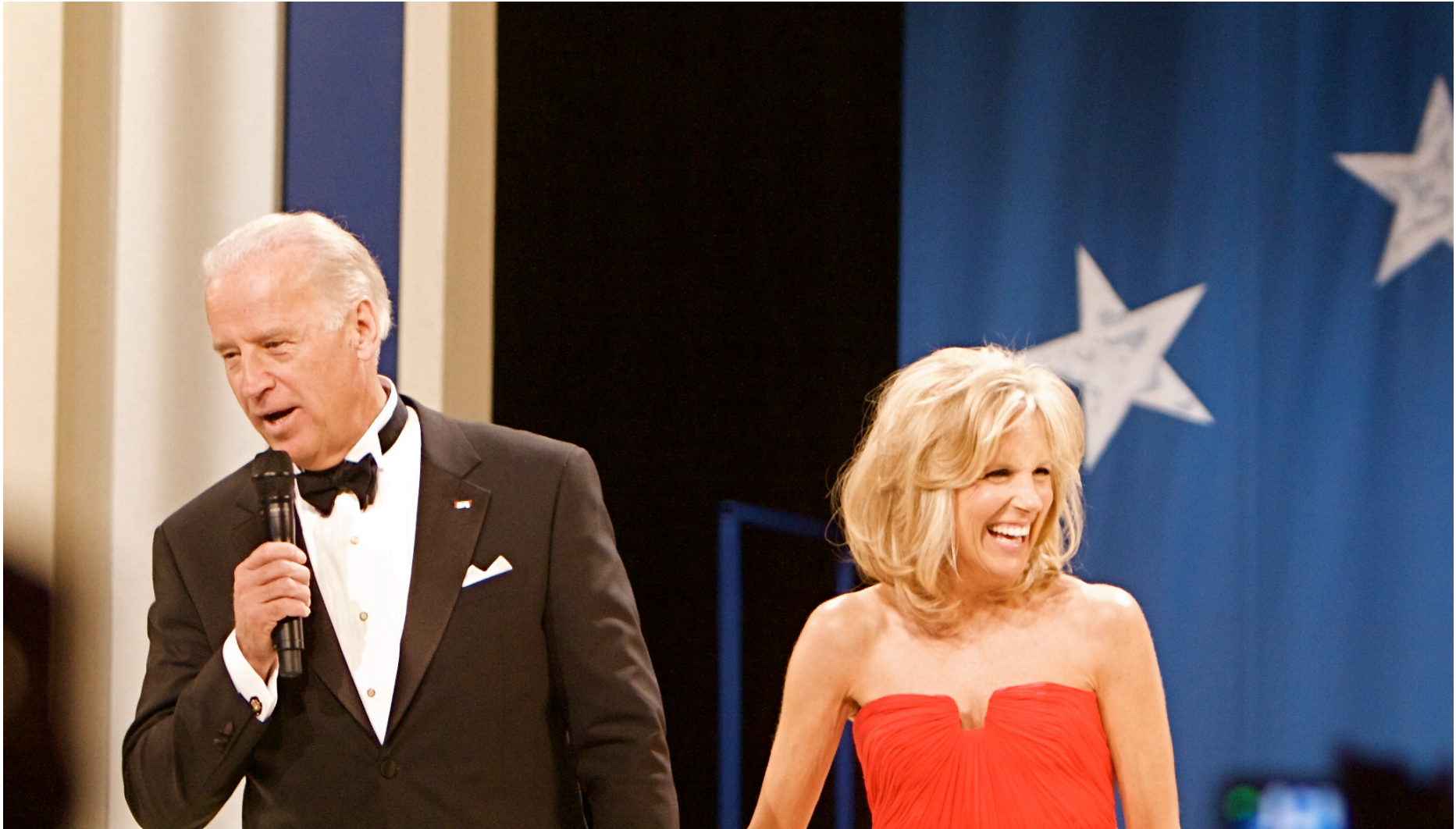
https://commons.wikimedia.org/wiki/File:Vice_President_Joe_Biden_and_Dr._Jill_Biden_(3215191787).jpg